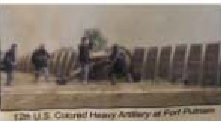
12th U.S. Colored Heavy Artillery at Fort Putnam