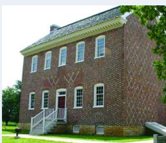
WILLIAM WHITLEY HOUSE