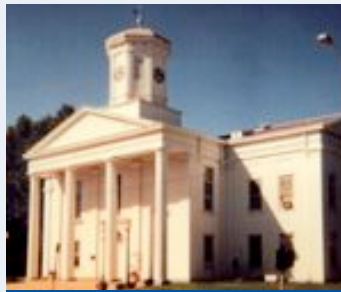
HARRISON CO. COURTHOUSE