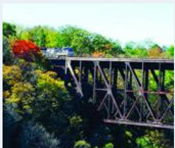
HIGH BRIDGE HISTORIC PARK