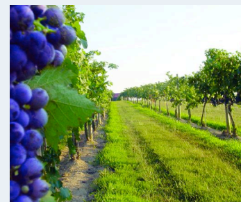
EQUUS RUN VINEYARDS