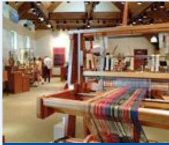
KENTUCKY ARTISAN CENTER