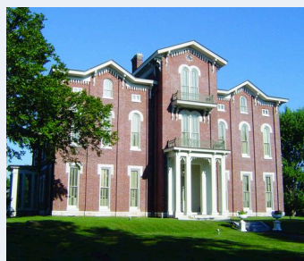
WHITE HALL HISTORIC SITE